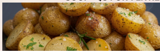
ROASTED POTATOES - $25