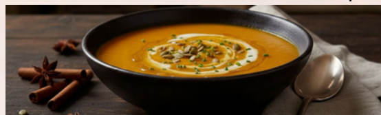
SOUP - $5 FOR 1 LITRE